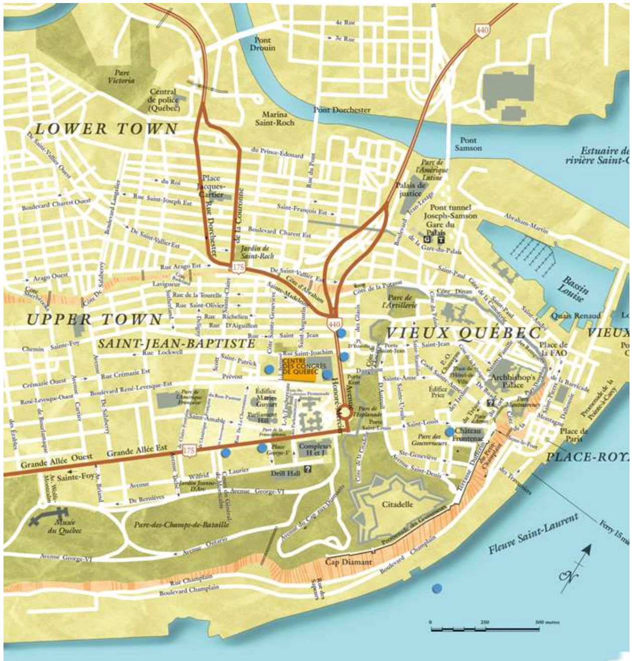
Quebec City Old Quebec, Lower Town and Upper Town